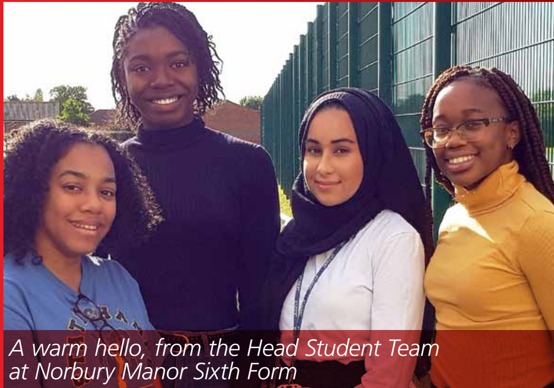
A warm hello, from the Head Student Team at Norbury Manor Sixth Form

You will find our sixth form a very caring place where we are all valued as individuals. Here some of our students and alumnae share their experiences and describe where your time at Norbury Manor can lead you.